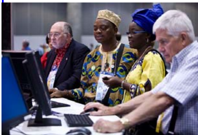
True internationality is shown as these Rotarians share a kiosk set up for email.