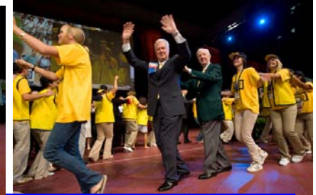
After the serious business of Polio eradication, the Youth Exchange students got the leaders dancing a "conga line"