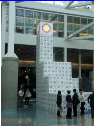
Rotarians at the 2008 RI Convention demonstrated their commitment to literacy by setting a Guinness world record for the most books donated during a seven-day period. Exactly 242,624 books were collected this week for public school students in Southern California and Southern Nevada.