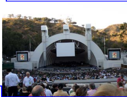
Rotarians enjoyed an evening at the Hollywood Bowl.