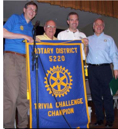
Trivia Challenge winners from Stockton Rotary!