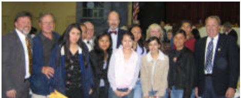
The All-Stockton Rotary Thanksgiving lunch where the Edison Interact students joined the Rotarians.